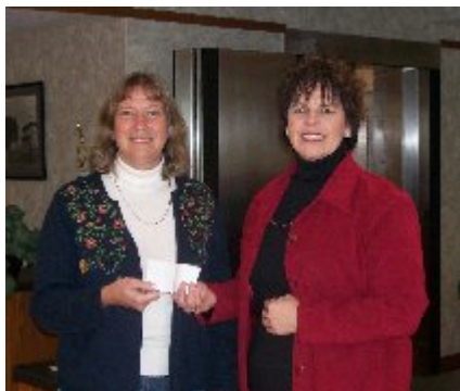
Presenting a check to Marshall Scholarship Fund using profits from Marshall Mania

We encourage you to join us! New ideas are essential to the creativity and success of our group. We meet the second Thursday of every month from 8-9 am in the Community Room at F & M State Bank in Marshall.