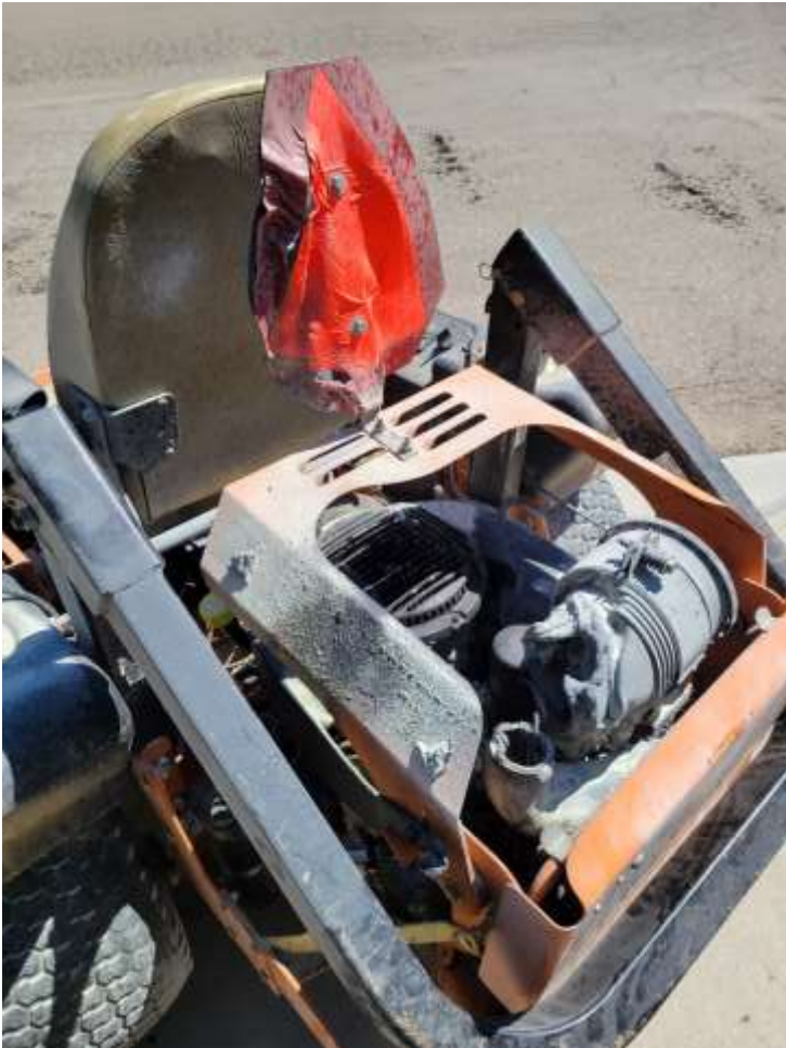
6/15 Equipment Fire Incident