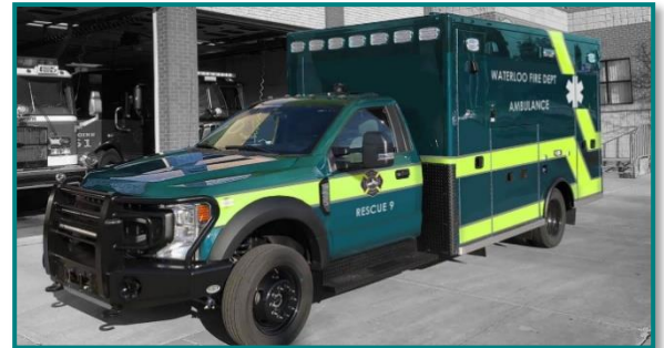
Rendering only. Not the actual truck.