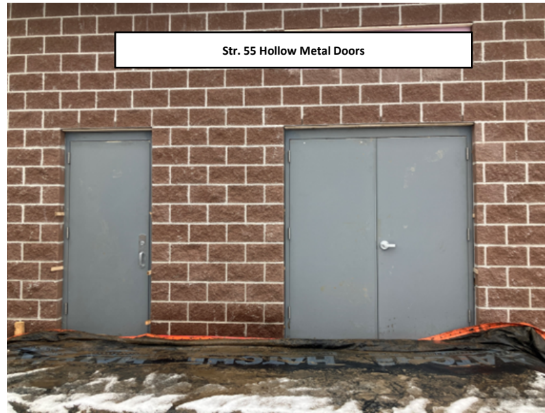
Str. 55 Hollow Metal Doors