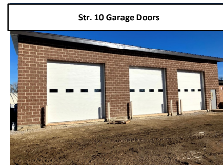
Str. 10 Garage Doors