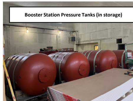
Booster Station Pressure Tanks (in storage)