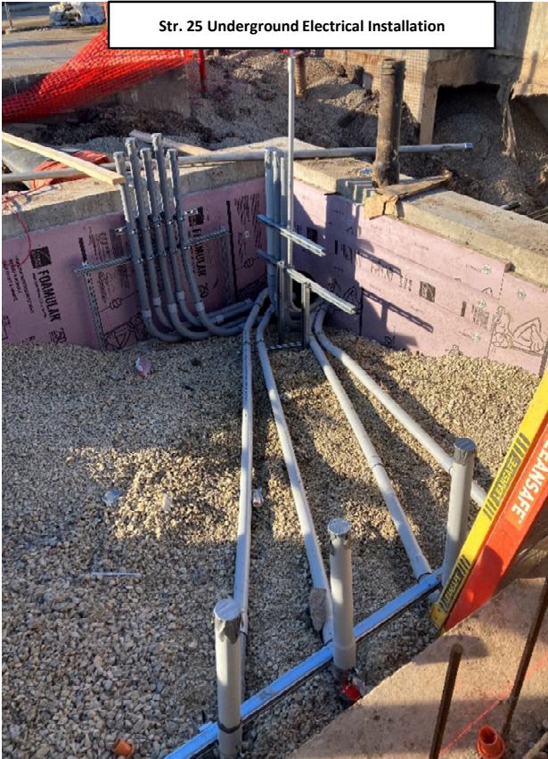
Str. 25 Underground Electrical Installation