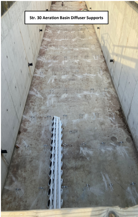
Str. 30 Aeration Basin Diffuser Supports